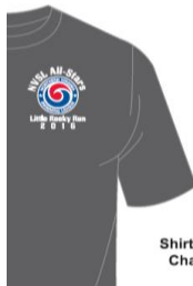
Shirt Color: Charcoal

If there are no silicone caps available, what is your new total order for the latex caps?